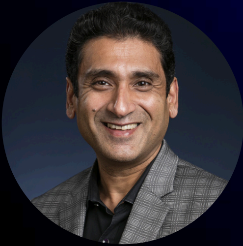
Dwight F. Benton Professor and Associate Dean Ross School of Business