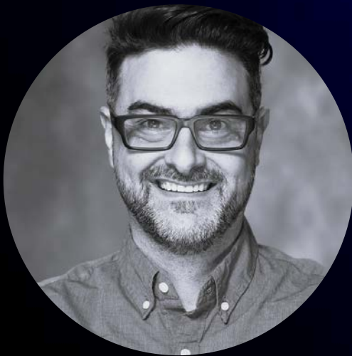
Professor and Interim Chairperson