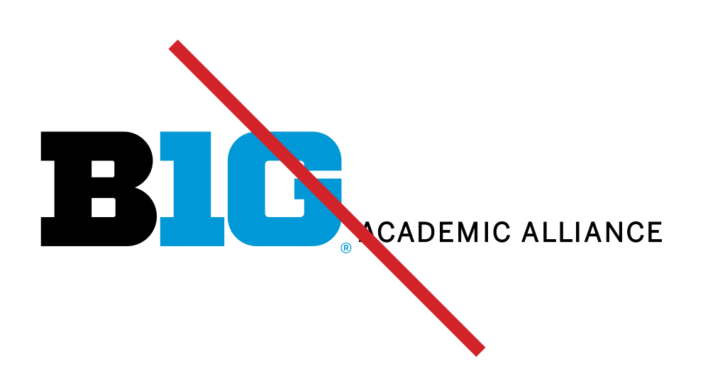
Unacceptable: Changing the position relationship of the logo's components.