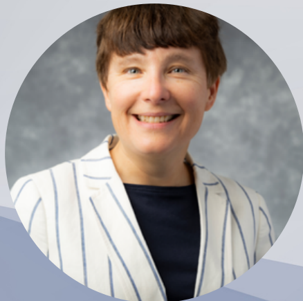
Vice Provost Faculty and Staff Affairs memeyerand@wisc.edu