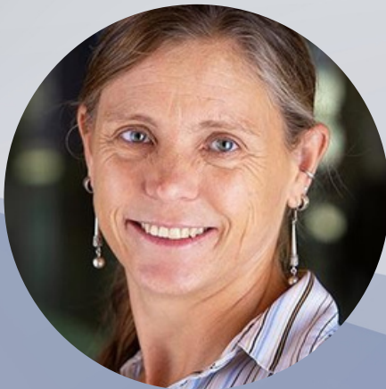
Chair and Professor Slavic & East European Languages & Cultures brintlinger.3@osu.edu